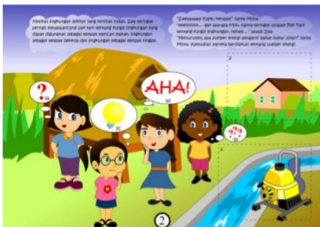
Figure 2. The front page of the lift the flap