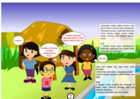
Figure 3. The backyard lift the flap